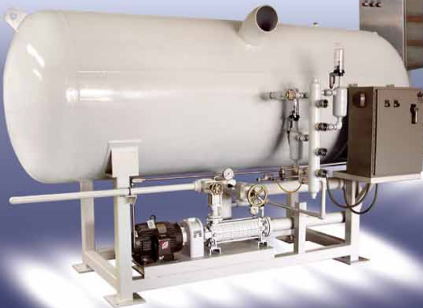
Plate & Frame Chillers Totally integrated and prewired for all controls, easy to service, handles a variety of fluids for chilling process.

DSI Process Systems has expanded products and services to include refrigeration. We now manufacture plate & frame chillers, suction accumulators, skidded systems, and other related equipment.